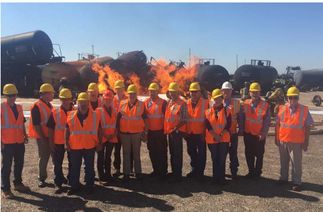
Members of the QA Committees for the AAR and RSI standing in front of a CBR mock derailment at SERTC

During the tour, members of the committees witnessed firsthand the training for “Crude by Rail Emergency Response” (CBR) at the Security and Emergency Response Training Center (SERTC). Founded in 1985, SERTC is a program that has trained more than 50,000 railroad employees, community first responders, chemical industry representatives, and other government and community officials in hazmat emergency response procedures.